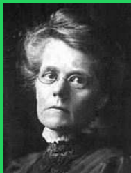
Alicia Boole (later Stott, 1860-1940)

Born to George & Mary Boole, grew up in Cork and London. She never attended university or held an academic position. Was a pioneer in the visualisation of 4-dimensional shapes rediscovered the six regular 4D polytopes. She coined the term polytope for these and higher dimensional analogues of polyhedra. Wrote book chapters (1888), later published many papers, the University of Groningen awarded her with an honorary doctorate in 1914. In the 1930s she worked with Coxeter.