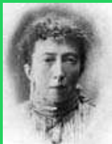
Mary Clerke (1842-1907)

Born Skibbereen, Cork, and was educated privately, studying mathematics, physics and astronomy at the third level in Dublin, and later in Italy. Settling in London, she published extensively, wrote numerous popular and well regarded books on the history of astronomy, and contributed to the Encyclopaedia Britannica on both astronomy and mathematics.