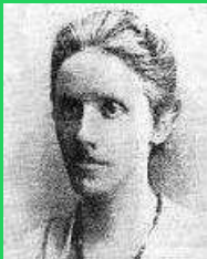
Annie Russell (later Maunder, 1868-1947)

Born in Strabane, Tyrone, educated Girton College, Cambridge. In 1889 she was the highest ranked mathematics student at the BA examinations, also ranked Senior Optime (second class honours), but as a woman was denied a degree.